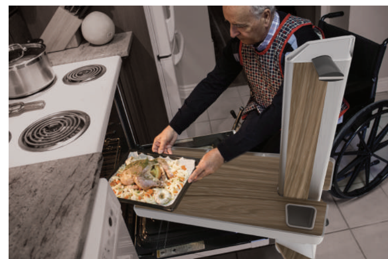
Accommodates wheelchairs, can fit around oven doors, and leave space for users when it is against counters