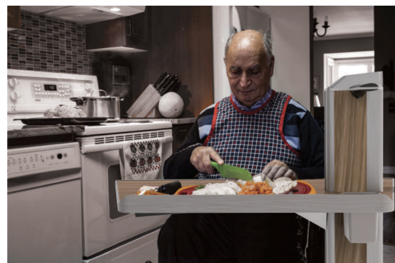
The height-adjustability allows Lift to be used as a counter at a suitable height for users of any level of ability

Lift features adjustable height and smooth mobility. This allows users to transport objects in the kitchen with ease, from the fridge, to the counter or over the sink, and in and out of the oven.