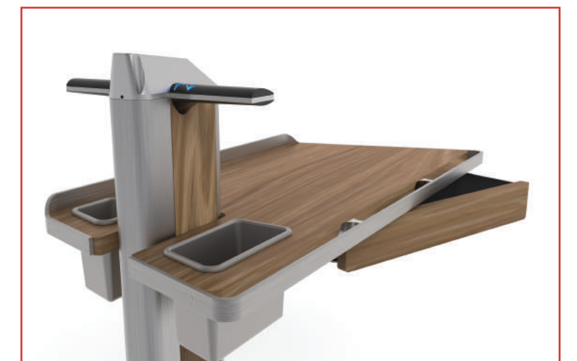
Integrated storage gives individuals with limited mobility more flexibility to be more creative in the kitchen