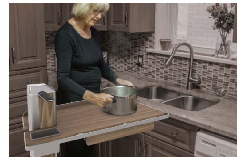
The platform can be raised and lowered to assist with lifting heavy or hazardous objects